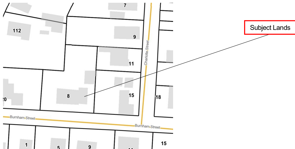
Figure 1- Key Map. County of Peterborough eMaps, May 2025

The property is known municipally as 8 Burnham Street, located in the Village of Lakefield. The property owner underwent significant pre-consultation with the County and Township to sever a small portion of her property, in order to facilitate small-scale development.