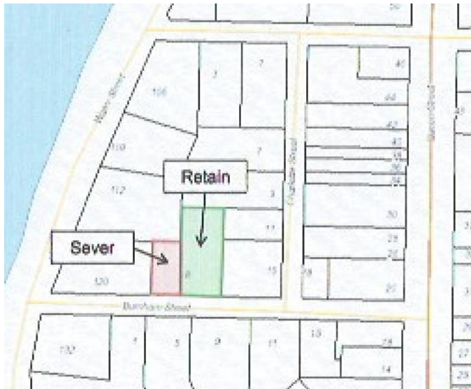
Figure 3- Excerpt from Concept May 2025